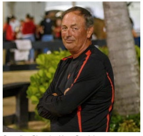
Canadian Olympian Yann Candele.